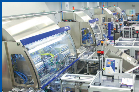
Figure 1: High-performance automatic assembly and test systems.

Providers of automation solutions should be involved from the very beginning of product development. As a fully integrated project partner, we often learn all about the process at the same time as our customer. We always have a sound grasp of the risks involved and, through constant communication, we are able to anticipate future changes – from design for assembly to proof of principle, and from the validation process through to the pilot line and highperformance production (Figure 1).